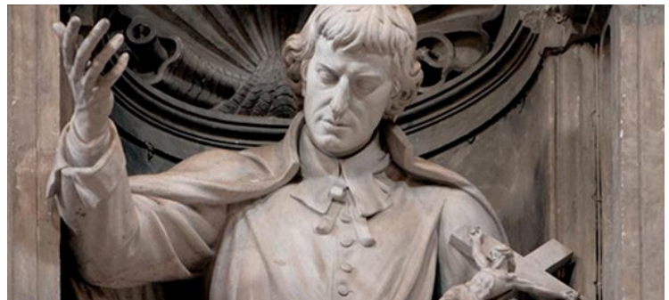
St. Louis Marie de Montfort

The Legion warfare is won over through their union with Mary and through her, with her, in her and for her, their union with Jesus and their living out of Montfort's True Devotion to Mary, inaugurated by a formal act of Consecration and the subsequent living of that consecration. The True Devotion must represent not an act but a state. They are then assured of their success and imminent victory in advancing the reign of Jesus Christ.