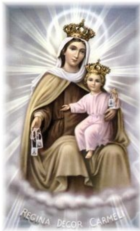
On the Feast of Our Lady of Mt. Carmel 2018

Like any warriors, the Legion is composed of members who are in active service (active members) and those who support the troops by their work and prayers (auxiliary members). It took its nomenclature from the old Roman legion thereby using such Latin terms as Praesidium, Curia, Senatus etc. that gave the Legion a note of universality and unity. Both active and auxiliary members has the obligation to pray every day the official prayer in the Tessera.