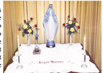
THE LEGION ALTAR

The Legion's goal is not just to lead people in prayer nor just to introduce Mary to them; but instead, the ulterior motive is that Christ will be brought closer to all people through Mary and with full guidance of the Holy Spirit.