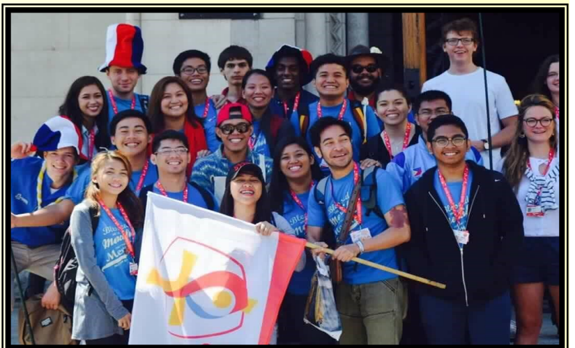
DIOCESE OF PASIG: PRESENT! DAYS IN THE DIOCESE OF LODZ

July 26 to 31, 2016-WORLD YOUTH DAY Time to go to Krakow for the WYD proper. We took the 6-hour trip and along the way, I felt the strong urge to call my family, whom I was missing terribly, thru Facetime. I talked to them in between my tears. When we arrived at Jagellonian University for our dormitories, we were all ecstatic, really excited. One of my most memorable experiences in the WYD proper was my being chosen to carry the WYD cross which was passed from one country to another. We arrived at the venue much earlier than the others and felt the scorching heat of the sun. Nothing can compare with my happiness in this event having been given the privilege to represent the Philippines, knowing that I was still a 5-year old child when the WYD was held in Manila. When Pope Francis arrived in Krakow, it was all over the news. We were in Blonia Park for his Welcome Ceremony and I was a few meters away from him when he passed by. I was busy with my two hands, one holding my camera for the photo, the other holding my cellphone for the video. I was so thankful to the Lord for the opportunity of getting that close to Pope Francis. I was literally crying buckets of tears after that moment. - cont. to page 3