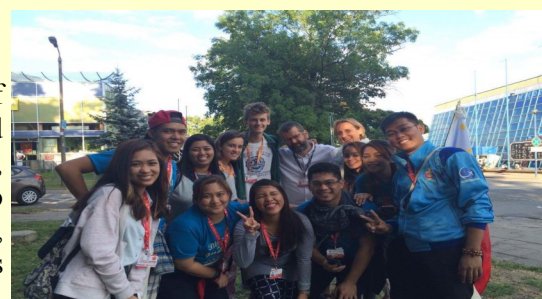
Philippines plus the whole world! With our new found friends from different countries