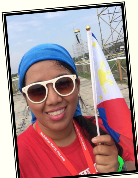
Welcoming Ceremony at Blonia Park: Proud Filipina in Krakow

might not be able to leave. After hours of waiting, we were finally brought to Belmonte Hotel at Resorts World due to the extreme delays, where we stayed until we could leave. We were billeted free of charge, complete with all hotel amenities. Despite the delays, we still felt blessed and had the time to rehearse our presentations!