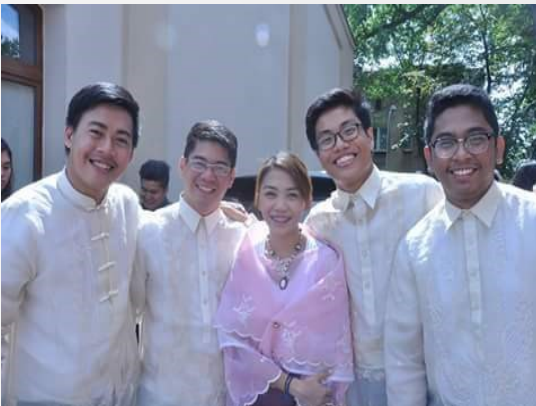
Serving at Mass to be presided by His Eminence Luis Antonio Tagle in St. Anne Parish, Lodz, Poland

feelings nandoon na, full package, ika nga. Happiness, joy, sacrifice, challenge, full of love. Napakarami kong natutunan sa World Youth Day experience, may mapupulot na aral at maibabahagi ko sa inyo at sa kapwa ko kabataan. May mga nagmarkang magaganda sa aking kaisipan at natutunan mula sa tulad nila